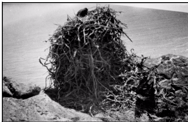
Figure 1. Historic photograph of the Ferrelo Point bald eagle nest. Photo taken by Herbert Lester in the spring of 1939 (SBMNH Channel Islands Archive No. 0081).

Early published and unpublished records between 1886 and 1939 suggest that bald eagles were an uncommon to fairly common breeding resident on San Miguel Island (Streator 1888, Streator unpubl. field notes, Willett 1910, Sumner and Bond 1939). The last known observations of bald eagles nesting at San Miguel Island occurred in 1939 when active nests were photographed on Prince Island (Sumner and Bond 1939) and at Ferrelo Point (Fig. 1) on the northwest end of the main island (Fig. 2). Bald eagles disappeared as a resident breeder on San Miguel Island sometime between 1939 and 1962. Historic eagle nests were still visible in the late 1970s and early 1980s on Castle Rock (four nests), at the northwest end of the island (2–3 nests) and along the southwest side of Crook Point (see Fig. 2; Jehl 1980, Kiff 2000). The Ferrelo Point nest was one of three historic eagle nests observed in 1979 at the northwest end of the island (Kiff 2000). This nest was located on top of a rock outcrop 99 m (325 ft) above the water approximately 2.1 km (1.25 mi) east of Point Bennett. The Ferrelo Point nest was photographed by Herbert Lester, the island caretaker, in the spring