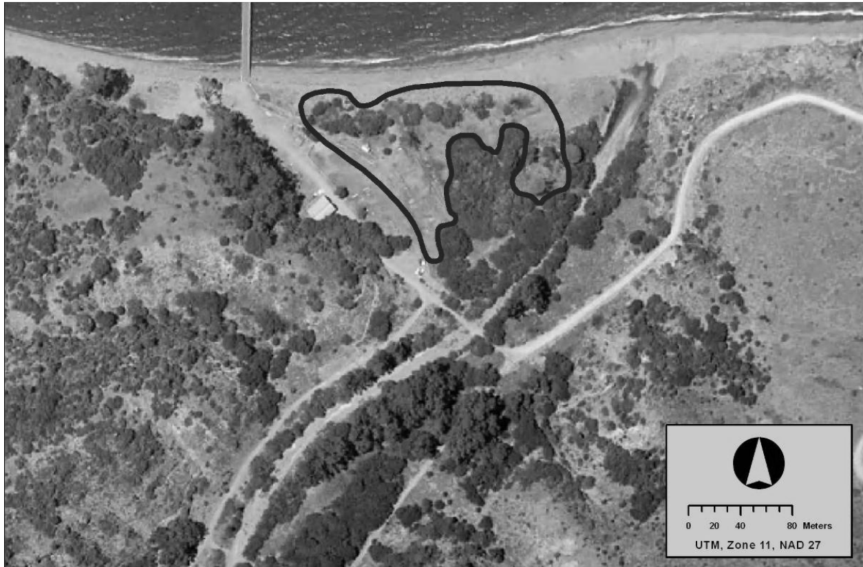
Figure 3. Local distribution of harvest mice at Prisoners Harbor, Santa Cruz Island, California. The broad dark line shows boundary of where harvest mice were captured from 2004 through 2006.

Harvest mice on Santa Cruz Island are also present in some drier upland areas, either in tall, thick grasslands, or in coastal sage scrub with intermixed grass and herbaceous vegetation. In coastal sage scrub, we captured harvest mice in gullies and small canyons that were wetter and had denser vegetation than the surrounding shrub