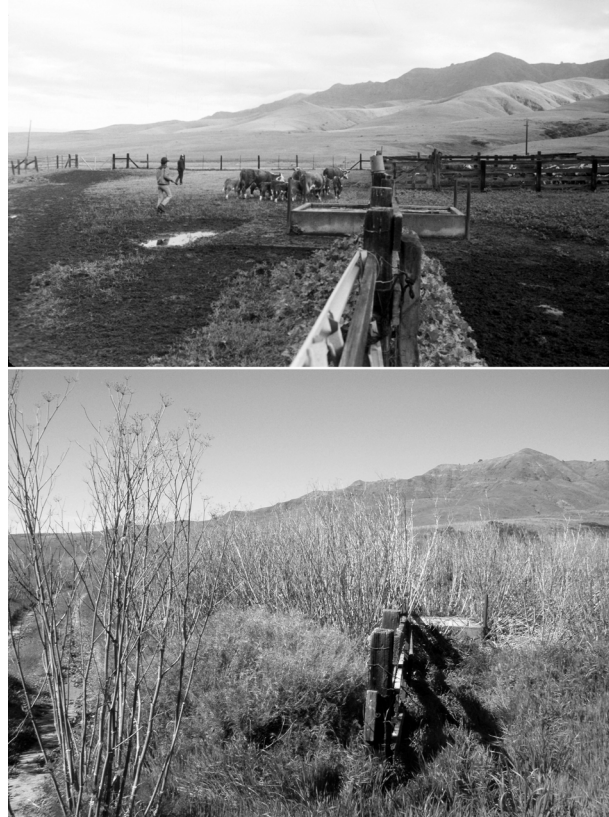
Figure 6. Christi corrals, 1982 and 2008.

Both the unintended and intended consequences of this plan are manifest in many vegetation patterns that can be seen on the island today. While fennel patterns may be one of the plan's more notorious unintended consequences, many island visitors may be surprised to learn that the distinctive vegetation