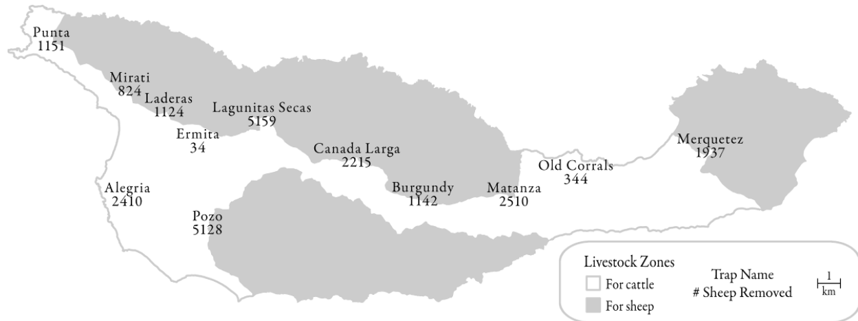
Figure 4. Clearing sheep between 1956 and 1962.

areas where no fence had been built previously, the materials used in the construction of the lines themselves were often taken from the earlier fences. This shows that the Stanton plan adapted the previous plan in a literal sense: by re-purposing the material artifacts that were left over from the old days. In particular, the braces of the H-post vertexes were redwood posts that had been salvaged from the earlier lines. On many of these, you can still find the cut nails and pieces of the old, thick gauged wire that distinguish the nineteenth century lines. In addition, a few old lines were adopted into the new configuration. This includes the east line of Matanza and the line that divides Embudo and Christi pastures. These older lines are characterized by a higher frequency of redwood posts (the earlier lines did not use metal posts) and either a more meandering line (without distinctive vertexes) or the use of X-braces at the vertexes (rather than H-posts).