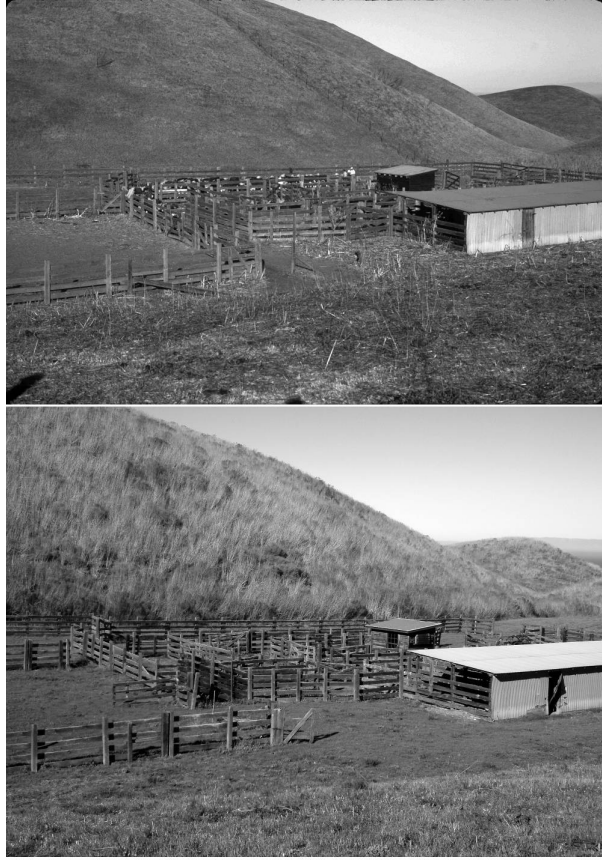
Figure 5. Campo Del Norte corrals, 1974 and 2008.

in the old corrals at Del Norte and Christi. Figure 5 shows the Del Norte corrals at two different moments in time. The top photo shows the corral in 1973 while the bottom shows the same location in 2008. In the foreground of the older photo, you can see fennel stalks that appear trampled. There are also a few isolated patches of fennel stalks on the hills behind the corrals, but the vegetation cover there is notably low and open. The fence stands tall in comparison. In the more recent photo, the cover in the foreground has been mowed by a machine and the hills behind the corral are covered thickly with fennel. Pictures from the west end show a similar story. Figure 6 shows the Christi corrals in 1982 (top) and 2008 (bottom). It is possible that the recurring pattern of the fall round-up—bringing animals to and from the Del Norte and Christi corrals in August, when fennel was in seed—facilitated the dispersal of fennel into pastures that were used to separate the cows and calves. However, the persistent use of the pastures limited the cover through constant grazing pressure. With