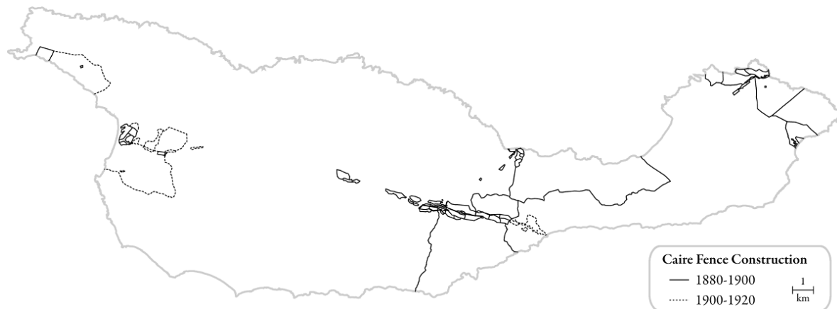
Figure 2. Caire fence plans for Santa Cruz Island.

series of plats for Santa Cruz Island (Derickson 1918–1919). We made copies from the collections of the Santa Barbara Museum of Natural History and the Channel Islands National Park, scanned these paper sheets, geo-referenced the maps based on ortho-rectified air photos, and then digitized the fence features. We then compared these fence features to those depicted in an older collection of maps made by the Santa Cruz Island Company in the late nineteenth century (Santa Cruz Island Company 1883–1898). In Figure 2, the black lines show fences that also appear in this older collection. We interpret the inclusion of these fences on these nineteenth century maps to mean that these features were part of the ranching plan in the late nineteenth century. In contrast, the dotted lines show fences that are not depicted in this older map collection. We interpret this to mean that these fences were constructed sometime in the early twentieth century.